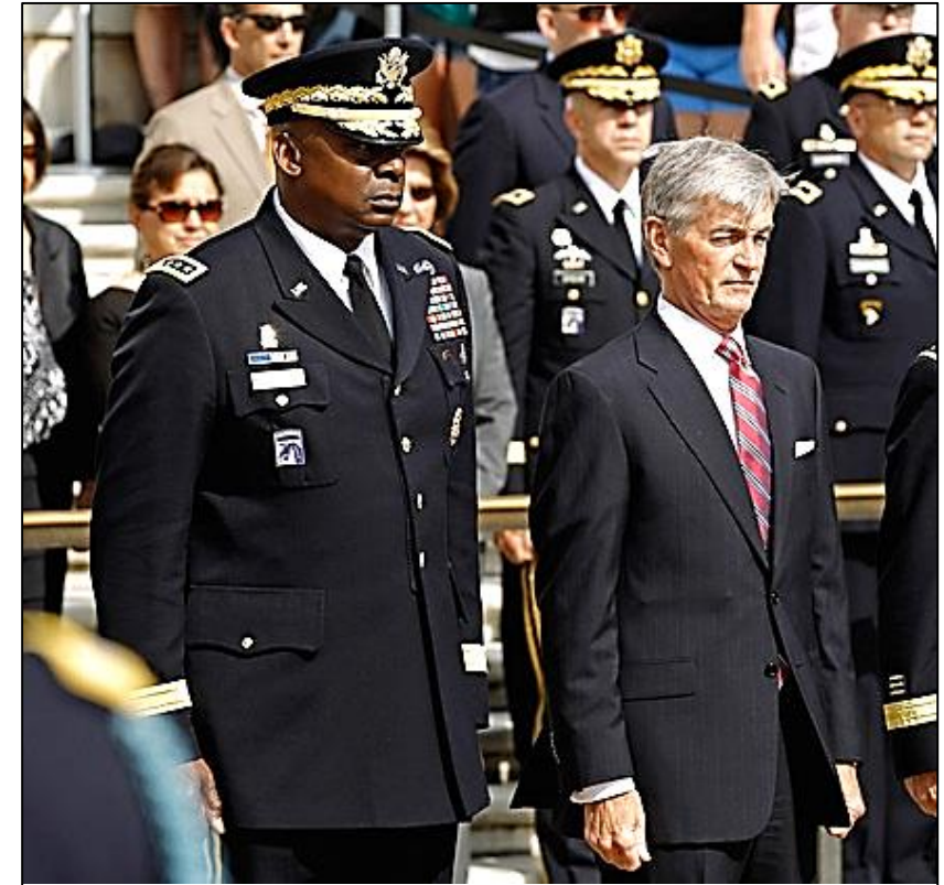
General Lloyd Austin and Secretary of the Army John McHugh