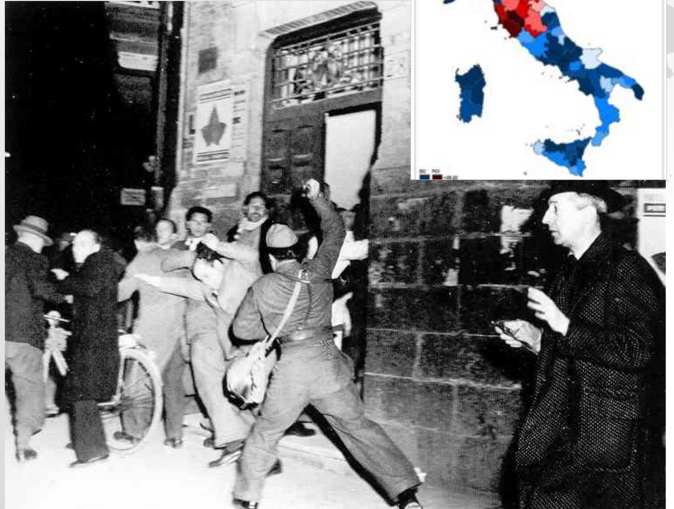
Italian police dispersing some of 50,000 Communists who had gathered to disrupt a rally of the Rightist Italian Social Movement -- Rome - 1948